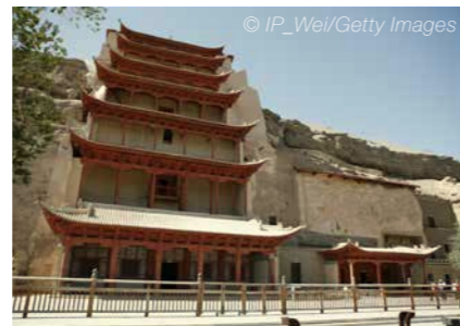
Dunhuang, in Western China, a key point on the Silk Road, home to hundreds of caves featuring early Buddhist art and statues