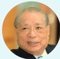
Third President DAISAKU IKEDA www.daisakuikeda.org

cofounded the Soka Gakkai and was imprisoned together with his mentor during the war. On his release from prison, he reestablished the Soka Gakkai and developed a membership of some 750,000 households throughout Japan by the time of his death. Toda was ardently opposed to war, and his 1957 Declaration Calling for the Abolition of Nuclear Weapons is seen as the starting point of the organization’s peace movement.