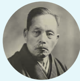
First President TSUNESABURO MAKIGUCHI

*The Soka Kyoiku Gakkai (Society for Value-Creating Education) was the forerunner of the Soka Gakkai (Society for the Creation of Value).