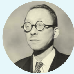
Second President JOSEI TODA www.joseitoda.org

Tsunesaburo Makiguchi (1871–1944) founded the Soka Gakkai on November 18, 1930, together with his disciple Josei Toda, and served as the organization’s first president.* An educator and philosopher, he was imprisoned during World War II for opposing the policies of Japan’s militarist government and died in prison.