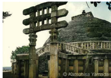
The Great Stupa at Sanchi, India, started by the Buddhist emperor Ashoka in the 3rd century BCE

A grassroots movement with 12 million members in 192 countries and territories worldwide, the Soka Gakkai is dedicated to sharing the empowering message of the Lotus Sutra and Nichiren Buddhism in today’s world.